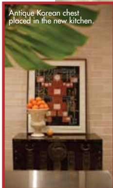
Antique Korean chest placed in the new kitchen.