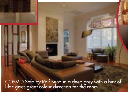
COSMO Sofa by Rolf Benz in a deep grey with a hint of lilac gives great colour direction for the room.