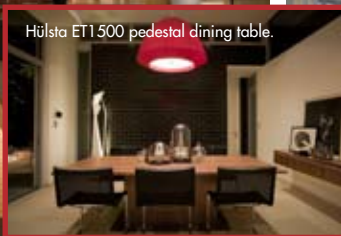
Hülsta ET1500 pedestal dining table.