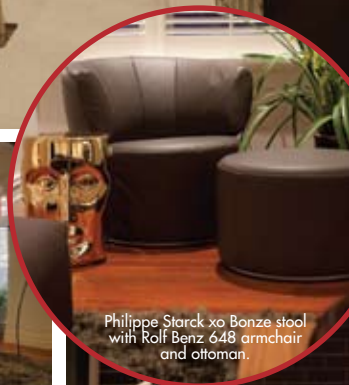
Philippe Starck xO Bonze stool with Rolf Benz 648 armchair and ottoman.