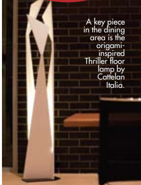
A key piece in the dining area is the origami-inspired Thriller floor lamp by Cattelan Italia.